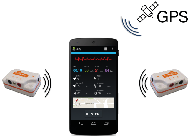
Fig. 3. Schematic application setup. The mobile phone receives live data from the two Shimmer sensors via Bluetooth and GPS data for location and speed features. The application (a screenshot of the main interface is visible in the figure) processes the data and displays the information.

implementation of our algorithms lies mostly in the windowing of the signals for enabling a real-time processing, through which important signal parts were lost. This is particularly noticeable in the treadle detection algorithm for the EMG signal due to the fact, that the width of the relevant signal parts in the EMG signal is wider than the QRS complex in the ECG signal. For this reason, the treadle detection rate in our application is inevitably lower than the heart beat detection rate. As already mentioned, a variation of the window size did not show any notable improvement. This is a deficit that definitively needs to be improved in further work. Because of the continuous motion of the user's body during biking, the accuracy of the algorithms (especially the heart beat detection algorithm) is diminished by motion artifacts and by artifacts resulting from the friction between electrodes and clothes. The usage of more suitable electrodes or other sensor platforms could probably reduce this problem.